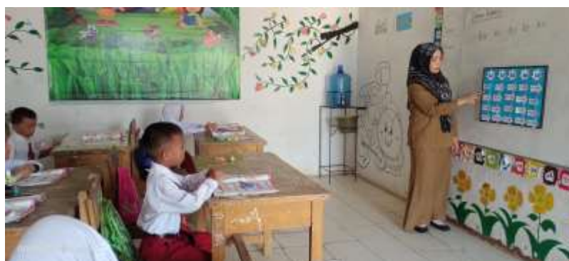
Gambar 1. Proses Pembelajaran Menggunakan Media Gambar

Image media is one type of component in students' environments that can stimulate them to learn, so that mathematics which students consider difficult and boring can become an easy and fun lesson. The process of using learning media in the teaching and learning process can arouse new desires and interests, generate motivation and stimulation of learning activities, and even give students more confidence to understand the material better. In this study, the researcher collaborated directly with the teacher to practice the visual media. The description of the teacher in carrying out or providing image media can be seen in Figure 1.