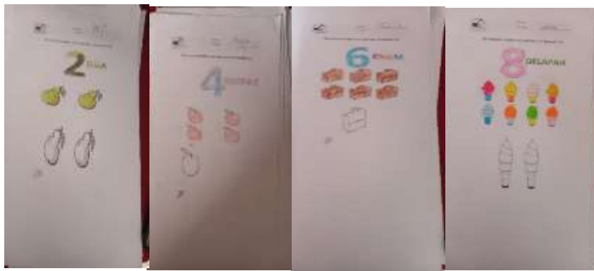
Figure 3. Students' Answers to See Students' Abilities In Calculating and Subtracting

to strengthen and improve student learning outcomes even though the media is simple media and is in paper form that is easy to obtain. Learning media is clearly capable of being a driver of teacher success in the learning process and can increase students' enthusiasm and enthusiasm for learning. Then, in line with that, researchers also looked at how media abilities could improve and influence students' ability to calculate. The students' answers using image media to see students' abilities in calculating and subtracting can be seen in Figure 3.