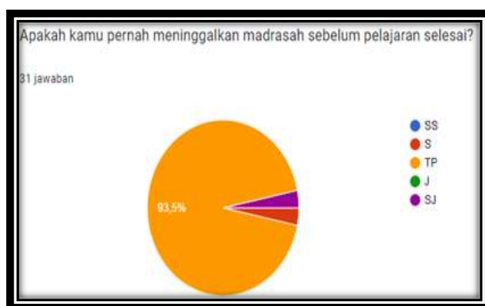
Figure 8. Leaving the Madrasah before the lesson is over

Leaving the Madrasah before the lesson is over or better known as truancy is one of the violations that is often committed by students. they think that skipping is something that will not be repeated on another occasion. Because of the period the school they are currently in will not get them a second time. But still, ditching activities can not be justified at all. Ditching is a school student activity which cannot be justified for leaving school without the permission of the teacher during lessons unfinished with specific aims and objectives (Kartika & Purnami, 2019: 316).