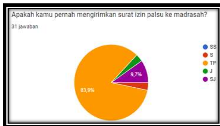
Figure 7. Sending fake licenses to Madrasah

Some students of MAN 2 Jambi City are students who live in boarding houses near the school. There are also those who live in the MAN 2 dormitory in Jambi City for women. If the student is a boarding school student, so when she is unable to attend, the student reports to the hostel mother and will be given permission not to go to school. If the boarding house's children are unable to attend, then most of them they ask friends to make permission letters with the excuse of being sick and so on. Matter that sometimes they don't have time to make it or sometimes they are forced to do it because there is no other way.