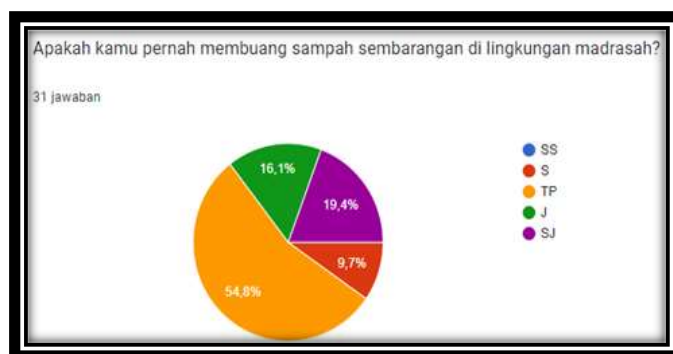
Figure 4. Disposing of litter in the Madrasah environment

human life (Sabri & Nasfi, 2020: 139). There are so many students who throw garbage carelessly. This is a frequent habit done. Sometimes lazy to walk to the trash can, they put the trash in the desk drawer without realizing that it can become a mosquito nest and cause disease.