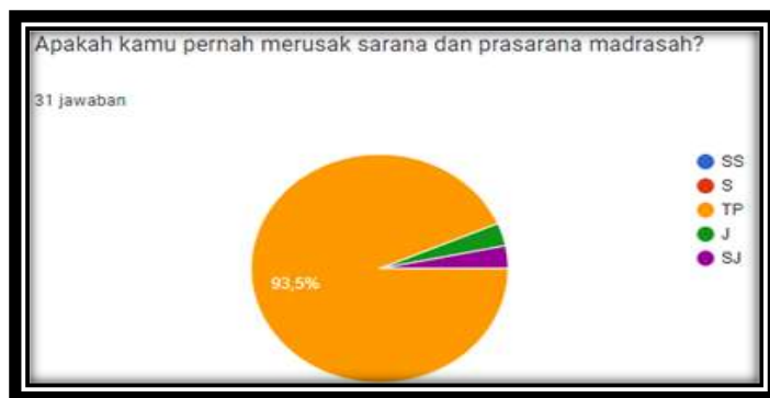
Figure 9. Damage to Madrasah facilities and infrastructure

Analysis of the factors causing students to violate the tenth school rules is because to know who is more powerful. His violation was getting into fights (brawls) within the Madrasah environment. This violation is contained in the student rule book MAN 2 Jambi City with sanctions given in the form of a warning letter.