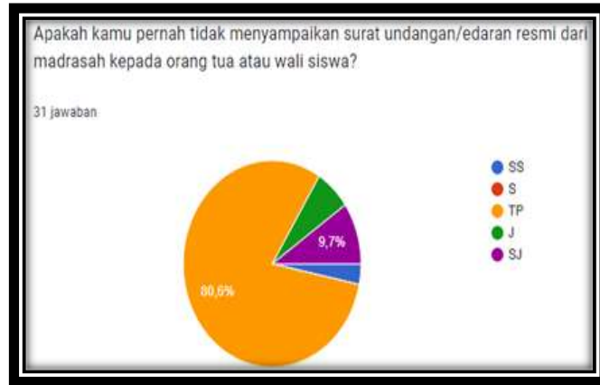
Figure 6. Failure to deliver an official letter of invitation/circulation from the Madrasah to parents or guardians

After being given an invitation letter, students did not save it first and it resulted the letter is gone. Sometimes the student brings the letter home, but forgets to give to parents or guardians. The memory possessed by a person is related with the experience that person has (Nofindra, 2019: 22-23).