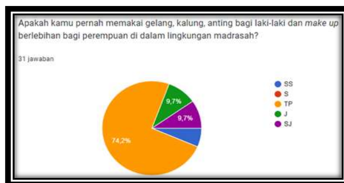
Figure 5. Wearing bracelets, necklaces, earrings for men and excessive make-up for women

Today, the way people dress is very self-reflective. one that causing fashion to become very popular is due to the fashionable clothes, various various accessories and other objects that are easy to see (Tyaswara et al, 2017: 295). Fashion that is used by today's children, namely students, is in the form of things that are easy to do they get and they are comfortable to wear so that not a few of them violate it school rules for the sake of convenience as their fashion.