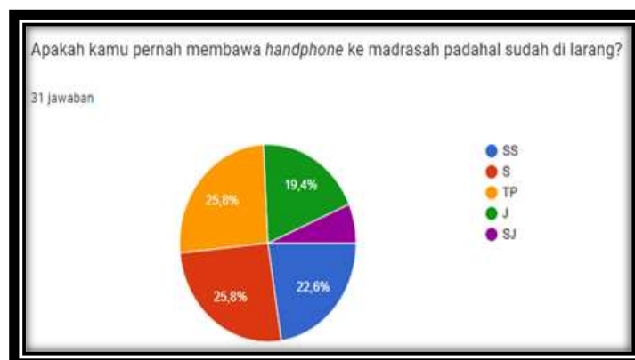
Figure 1. Bringing a cell phone to Madrasah

Mobile is a flat object that is currently really needed by the wider community including students. Mobile is a communication tool that conveys messages both verbally and in writing with a small size so that it is practical and easy to carry everywhere (Putra et al, 2021: 83). Information becomes a very important social media entity because it is shared with the content information they broadcast through existing networks. Last names communicate with each other through information content. Then information becomes goods in an information society. information on production, distribution, exchange, repackaging, storage and consumption (Widada, 2018: 24).