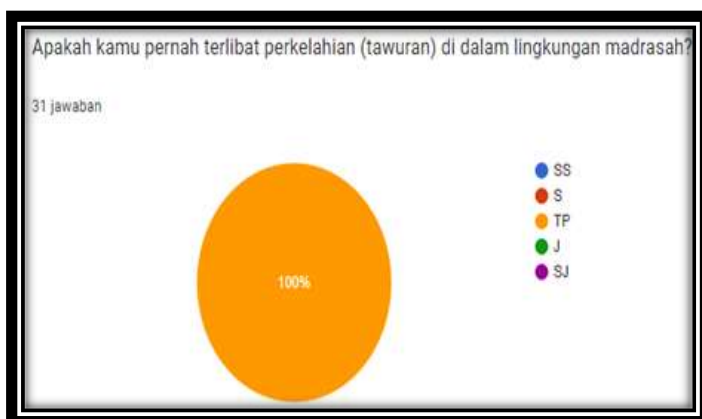
Figure 10. Involved in fights (brawls) within the Madrasah environment

Brawls between students are included in juvenile delinquency in the form of a problem conflicts faced by students related to social problems and psychological problems caused because they say things that are inappropriate for students to use and even make fun of make fun of friends so that this triggers a brawl (Boehari, 2021: 30). Juvenile delinquency or decreased behavior by minors is the result of the indiscipline of a teenager which is contrary to the rules that are required in the family, environment or school. The reasons why young people are not disciplined before proper instruction are lack of restraint, inability to adapt to the climate, and lack of serenity due to poor quality housing construction (Syifa et al, 2022: 5520). We can see that as many as 31 students of MAN 2 Jambi City who filled out the research questionnaire had never involved in fights (brawls) within the Madrasah environment.