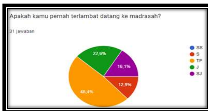
Figure 3. Coming late to Madrasah

It's not a strange thing anymore when it comes to late school students. Coming late to school is a violation of discipline against the rules school order. Factors causing students to come late to school are not on purpose but because of the long distance between home and school as well as heavy traffic roads causing traffic jams so that students are late for school.